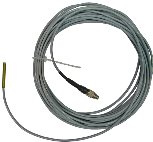
Soil / water temperature sensor Version 3.0 and later