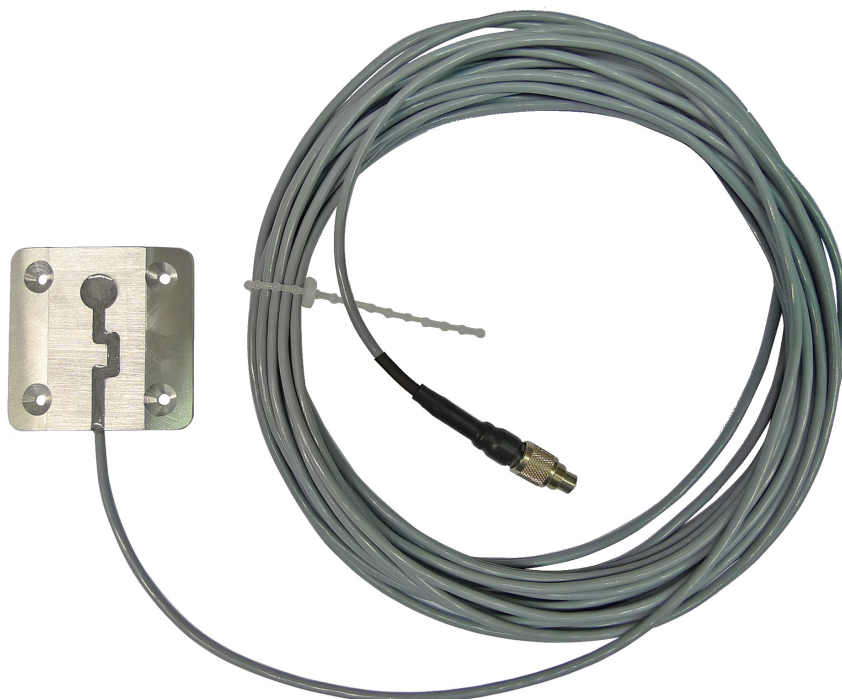
Road surface - temperature sensor Version 1.0 and later